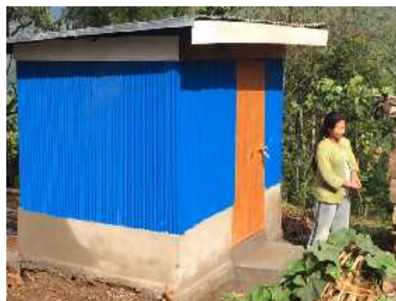
Latrine after Intervention