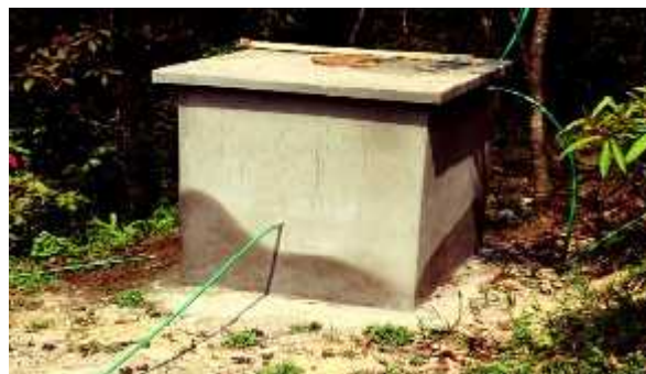
A newly Constructed Catchment and Distribution Tank