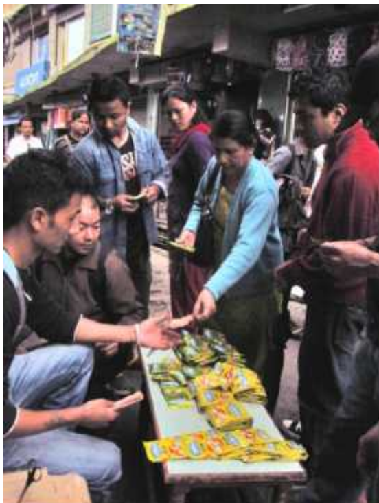
Customers Buying Darjeeling Spices

Sales and Marketing: Marketing runs were continued to cover retail shops along the main highway and