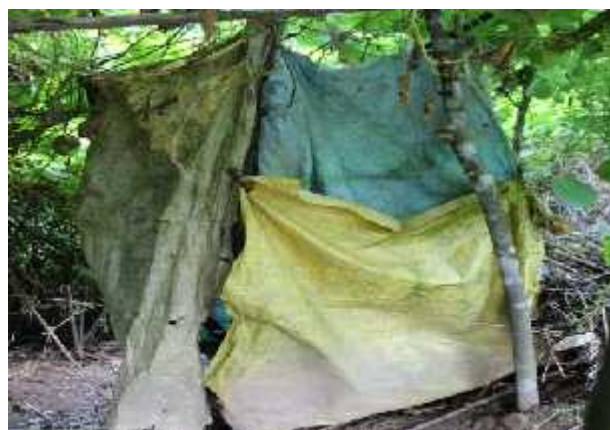
Latrine before intervention